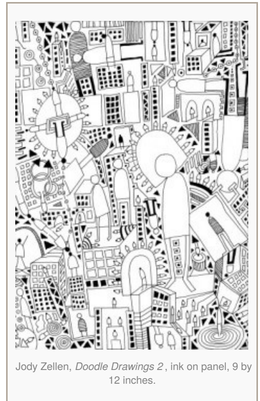
Jody Zellen, Doodle Drawings 2 , ink on panel, 9 by 12 inches.

These influences are also prominent in the black-and-white “doodle drawings” with their dense whirls of anonymous figures and buildings. Zellen’s fusion of critique and play is at its absolute best in Time Jitters (2014), an installation room created for this exhibition in collaboration with faculty from the College of Charleston. Two of the interior walls cycle through a series of stills and color patches, mimicking the restless refreshing of headlines. The other two appear blank until you enter the room, when several overhead object tracking cameras lock onto your location and display an image on both walls at once. The tracking system then enables your body to serve as an interface. As you move through the room, the images on the facing walls follow you, giving rise to an uncanny dynamic of being both pursuer and pursued, as if it were possible to be hunted by an image. The images themselves change throughout this pursuit. At the furthest distance away, they are tiny black-and-white outlines, but as you approach they become ordinary photographs, then blocky abstract grids, and finally grids with superimposed figures.